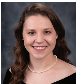
Mary Catherine Beard