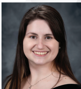
Cristina Marie Magnanelli